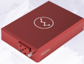
Alpha - 1030 nm - 1 GHz