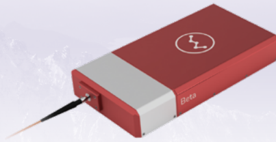
Beta - 515 nm - 1 GHz